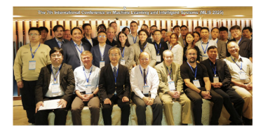
MLIS 2025 in Hong Kong

Since it was first held in Taiwan in 2019, more than 650 participants from over 35 countries came together to share their latest research findings. MLIS 2019, 2020, 2021, 2022, 2023, 2024 and 2025 were held successfully with the support from National Dong Hwa University (NDHU), Keimyung University, Huaqiao University and Faculty of Engineering and Green Technology (FEGT), Universiti Tunku Abdul Rahman.