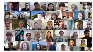
MLIS 2022 Online